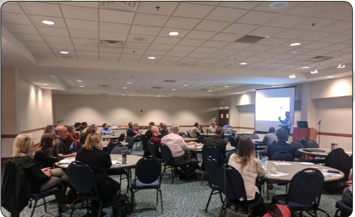
GLRC members at the 2018 GLRC Stormwater Seminar!