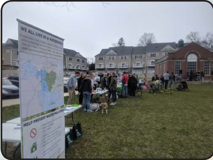
The GLRC at the "Big Green Gig", an Earth Day event hosted by MSU student groups